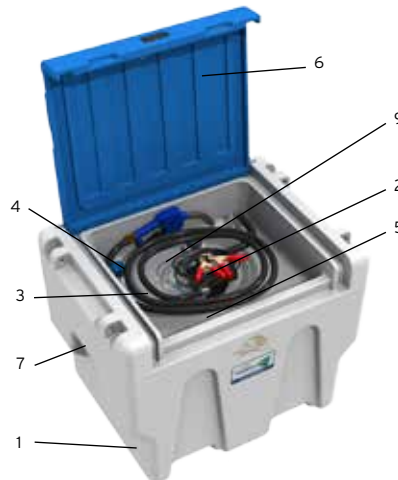
BlueTruckMaster 430 L